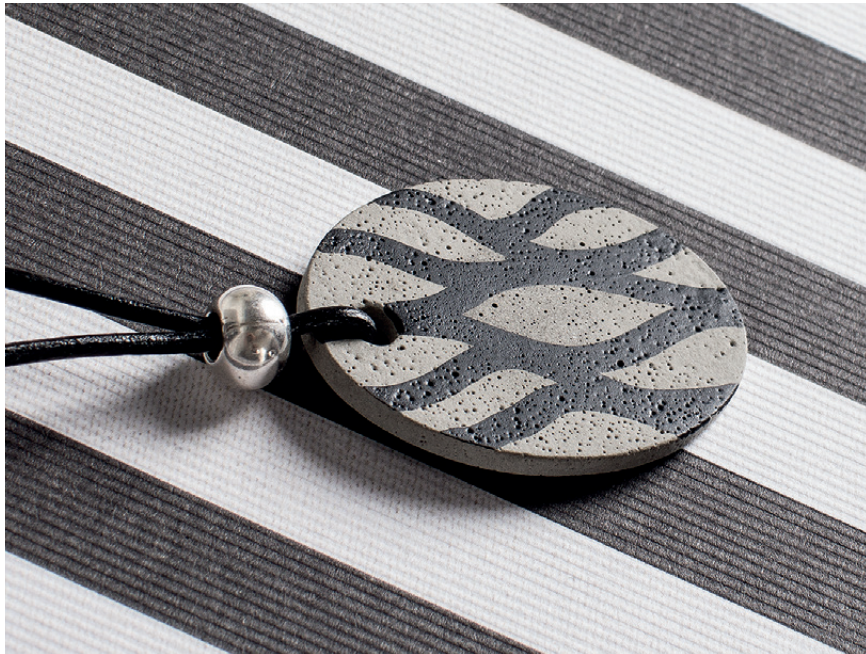
Item 8301802 + 35007102 ↑