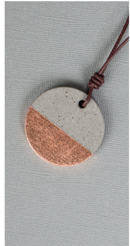
← Item 14769862