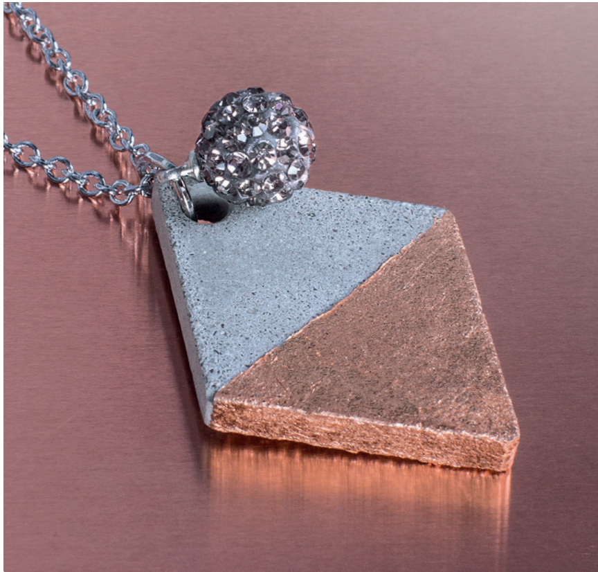
Item 2227622 ↑