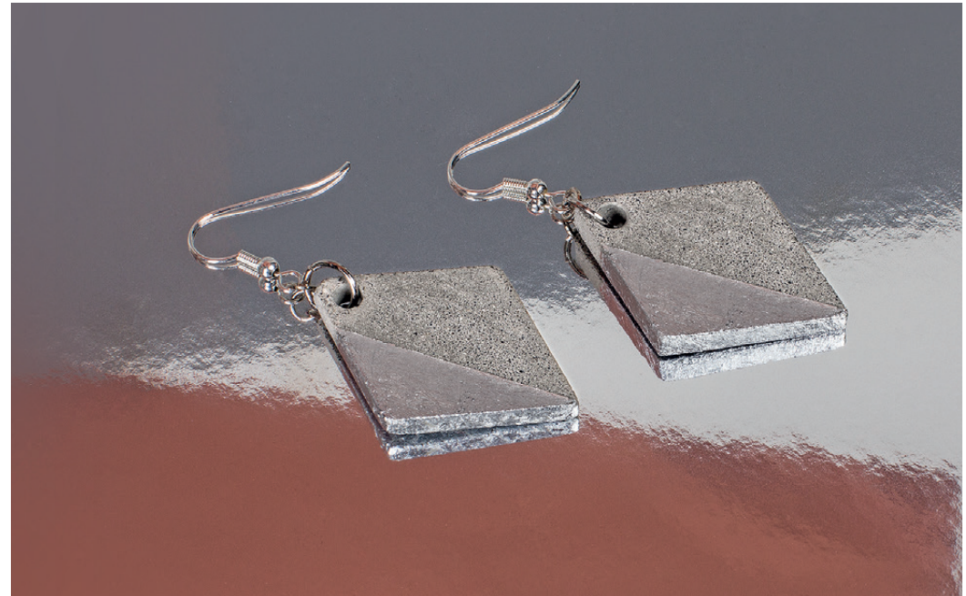
Item 2171522 ↗

Cement also harmonises excellently with silver (e.g. Rayher deco metal and the matching jewellery accessories). Perfectly for all those who prefer restrained elegance.