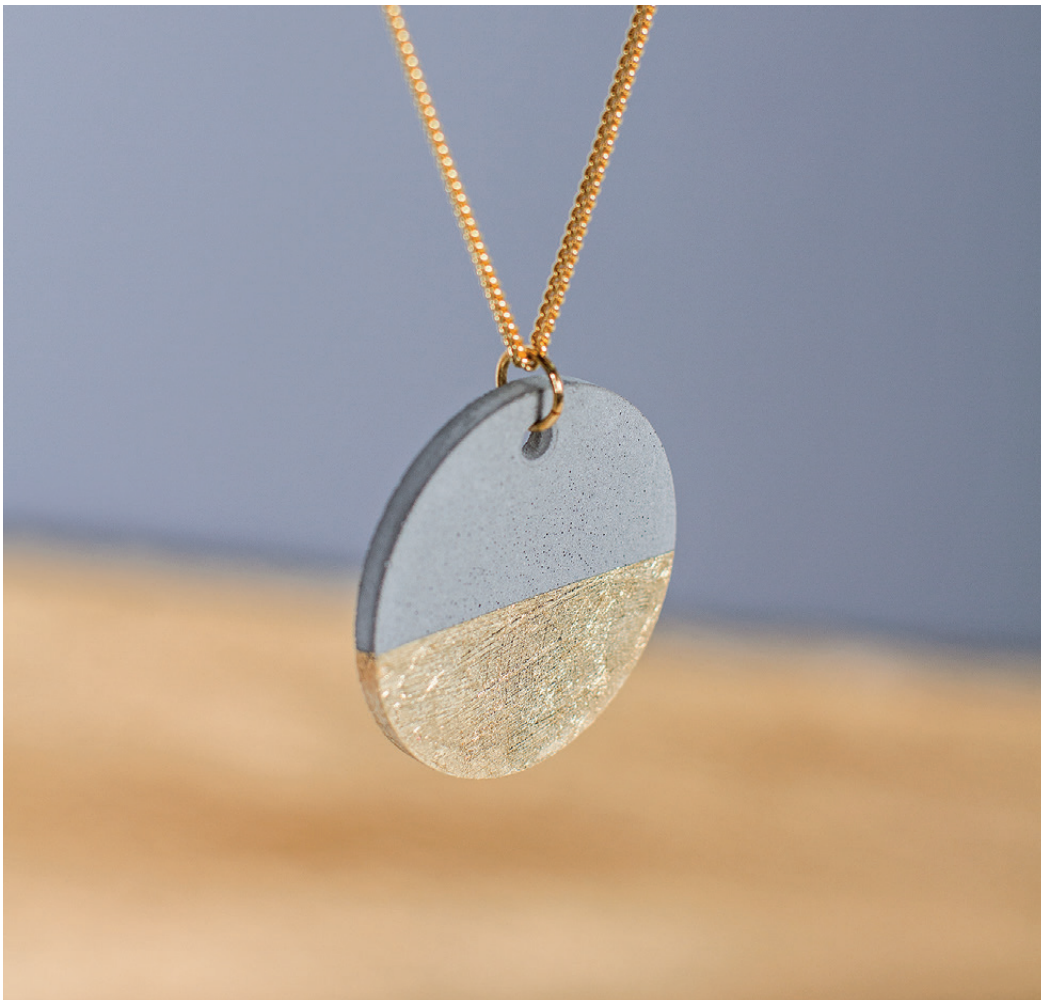
Item 34166000 ↓