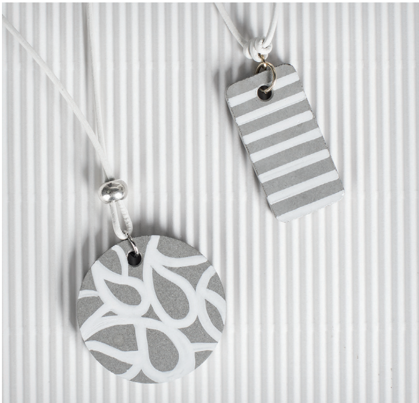
Item 8301801 + 35007576 ↓