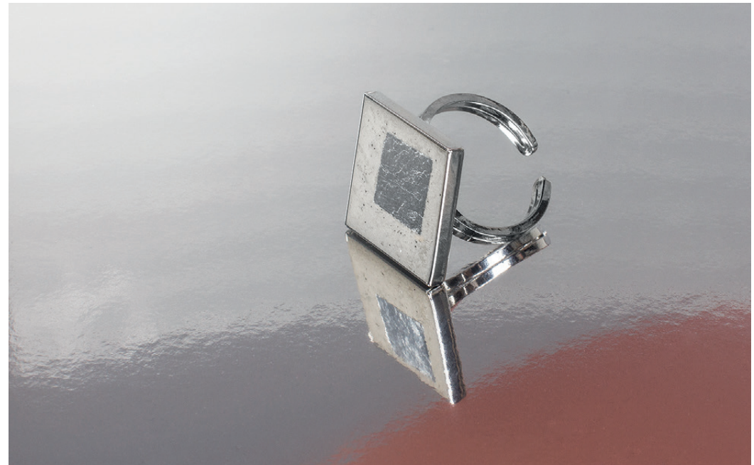
↓ Item 2235622