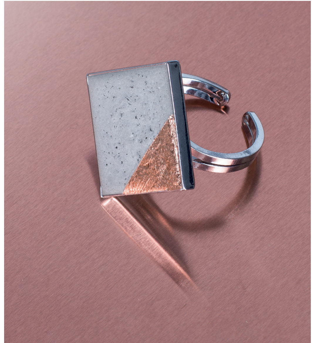
Item 2171524 ↗