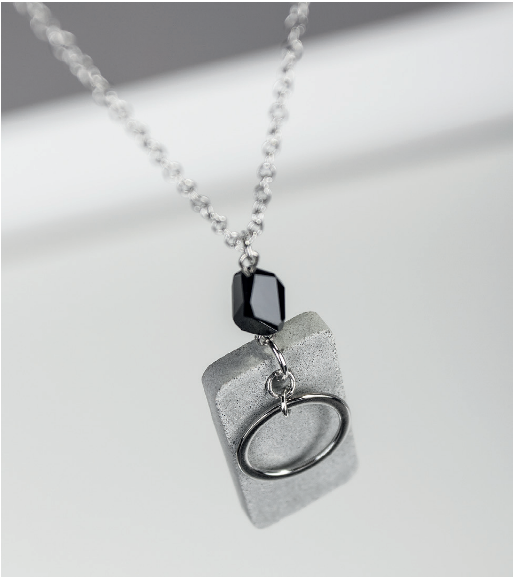
↶ Item 14787574